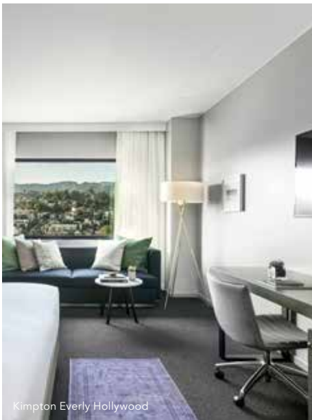
Kimpton Everly Hollywood