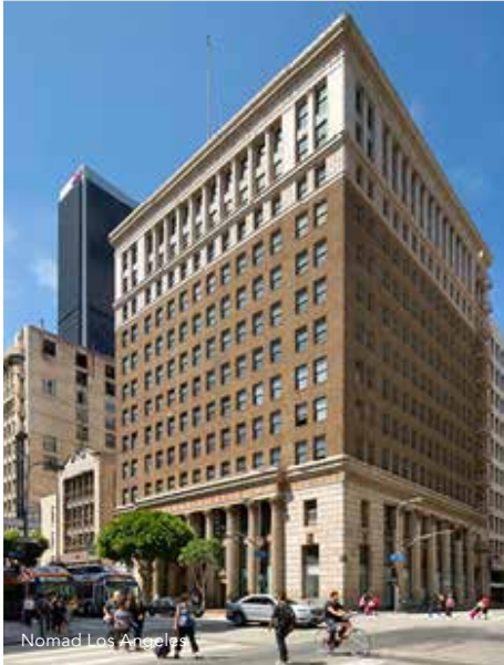
Nomad Los Angeles