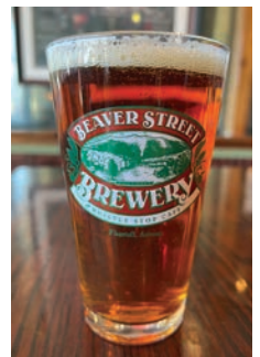
FLAGSTAFF CRAFT BEER