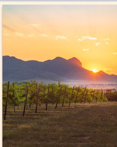
Kief-Joshua Vineyards – Elgin, AZ

Arizona has over 50 craft breweries and over 115 wineries throughout the state, many of which make award winning wine!