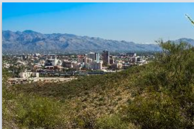
Tucson, Arizona – first UNESCO City of Gastronomy

Arizona is home to 3 UNESCO sites, including the first UNESCO City of Gastronomy.