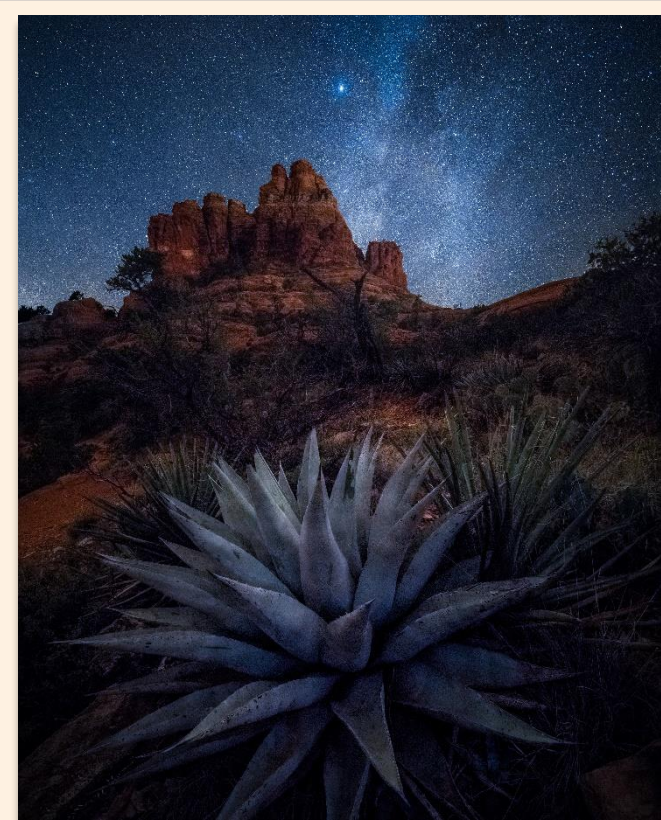
Bell Rock – Milky Way

Arizona has the most Dark Sky Communities in the world.