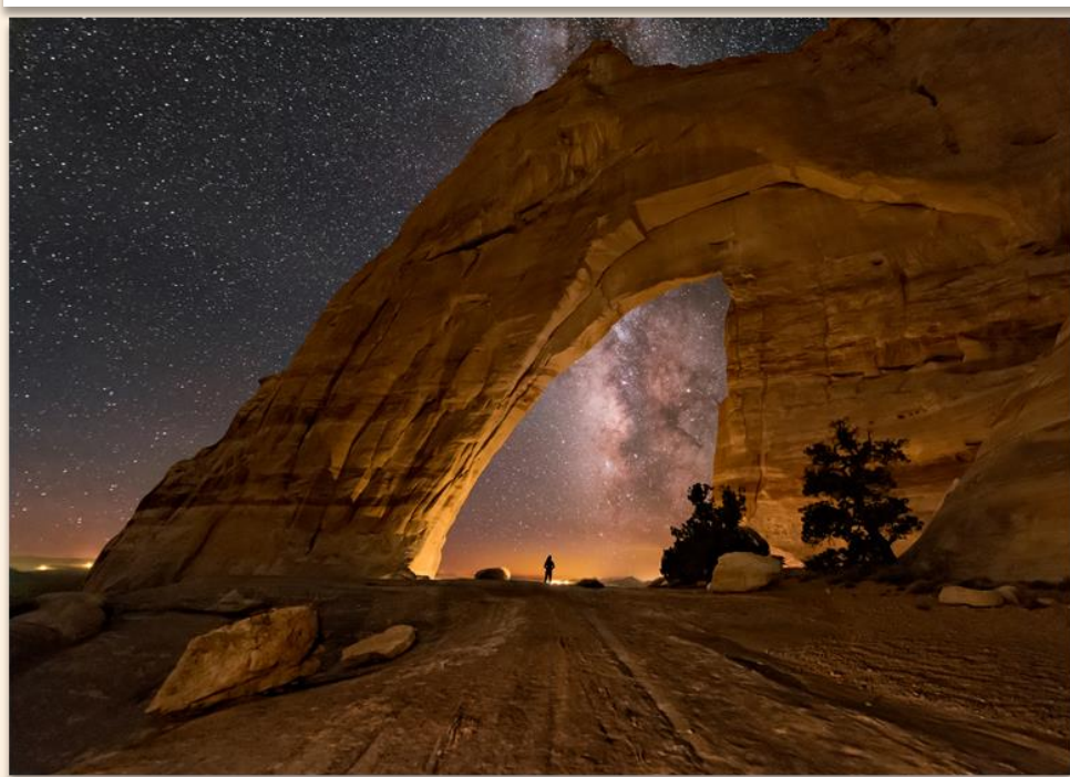
White Mesa Arch

Arizona is the astrotourism capital of America. Its diverse landscape—from the Grand Canyon and ponderosa forests in the north to the Sonoran Desert and “sky islands” in the south—is home to more certified Dark Sky Places than any other U.S. state or country, 16 to be exact. Of the 16, 2 are National Parks: Grand Canyon & Petrified Forest. The IDA (International Dark Sky Association) is based in Arizona.