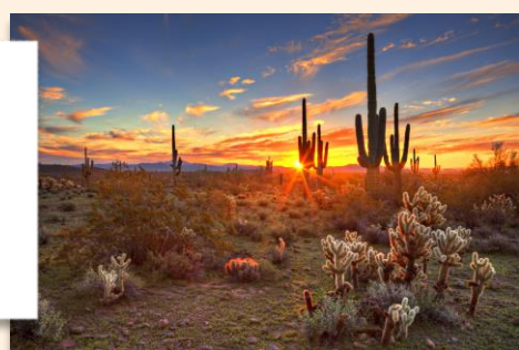
Saguaro National Park

Arizona has 22 National Parks and Monuments, 6 national forests, 35 state parks and 22 sovereign American Indian Communities.