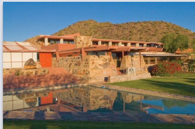
Frank Lloyd Wright's Taliesin West - World Heritage Site

Arizona has the most Dark Sky Communities in the world.