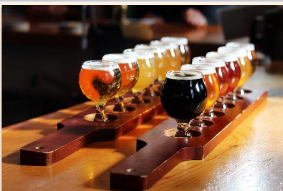
Mother Road Brewery – Flagstaff, AZ