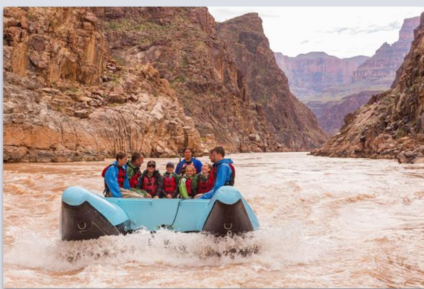
Hualapai River Runners – Grand Canyon West