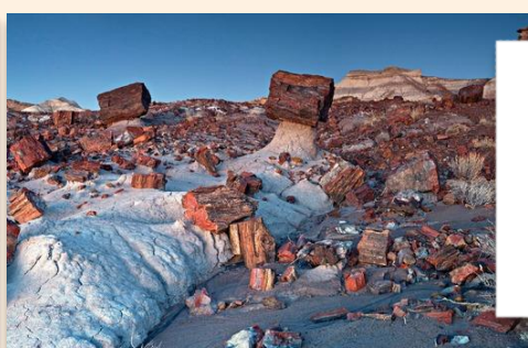
Petrified Forest National Park

Arizona has 22 National Parks and Monuments, 6 national forests, 35 state parks and 22 sovereign American Indian Communities.