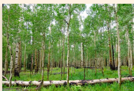
Coconino National Forest

Arizona is home to 3 UNESCO sites, including the first UNESCO City of Gastronomy.