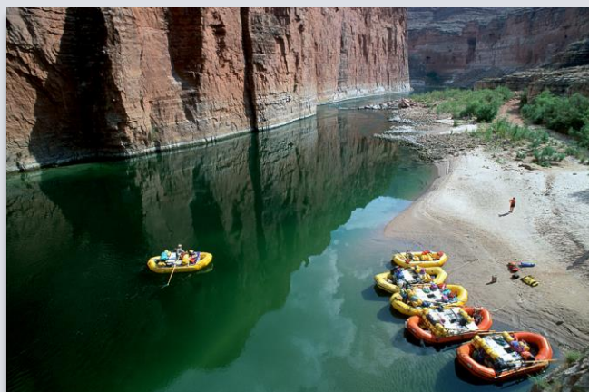
Grand Canyon National Park – World Heritage Site