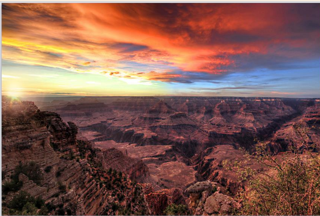
South Rim at Grand Canyon National Park

Grand Canyon West is about a 2hr 15 minute drive from Las Vegas, NV. White Water rafting, horseback riding, ziplining, or taking in an aerial view of the Canyon through a glass bridge on the Skywalk are just a few unique experiences you can find here.