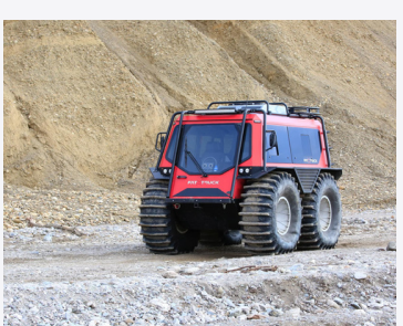
4) Fat Truck Tour: 2.5 hours $249 Per Person

Start with a three-mile ATV trail ride to your launching point through the scenic Alaskan wilderness. After gearing up, certified guides will lead you along six sky bridges and seven thrilling zip lines. Over half a mile of zips including the dual racer finale!