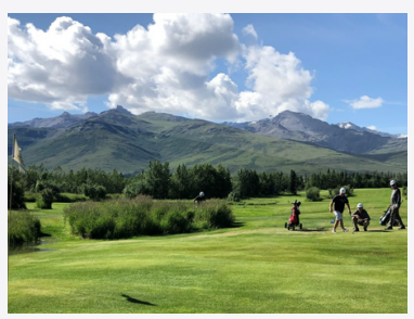
2) 9-Hole Tundra Golf: 2 hours $125 Per Person

rocky creek beds, hills to climb, water to traverse, and mud crossings. Total tour covers about 10 Approximately 1 ½ hours on the actual trails.