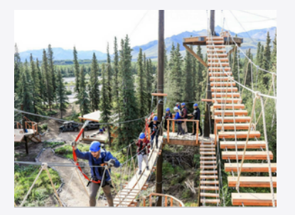
3) Denali Zip Line: 3 hours $165 Per Person

Black Diamond is a challenging course with "Alaskan hazards," such as tundra marshes or Ride on several terrain types. even the occasional moose There are coal mining trails, hoof print! The course is relatively short, which makes it accessible and fun for any style equipment play. miles. provided.