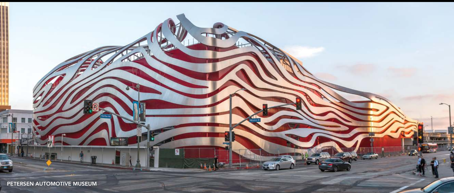
PETERSEN AUTOMOTIVE MUSEUM