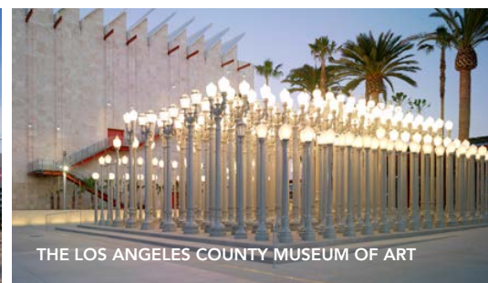
THE LOS ANGELES COUNTY MUSEUM OF ART